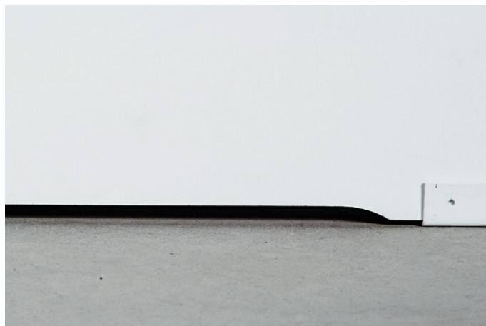
Slits for electrical cables