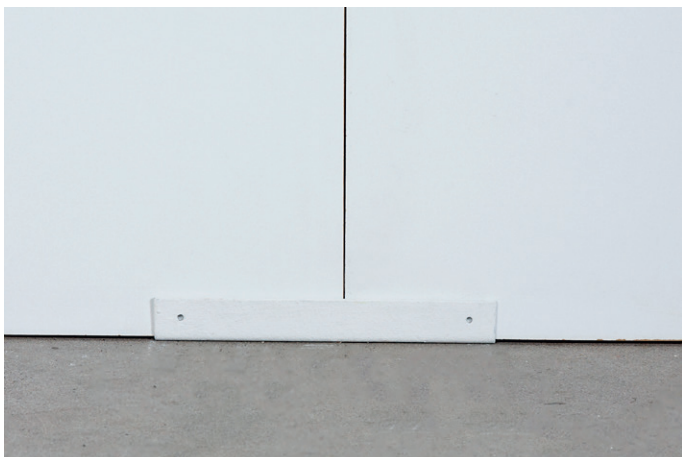
U-beam to fixate the walls