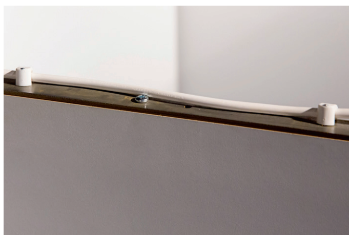
Possibility to fixate electrical cables