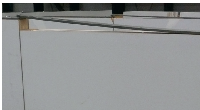
Handles uneven floors